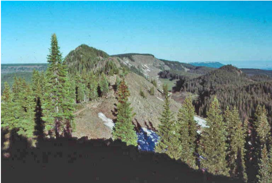
A view of Grand Mesa from the Crag Crest National Recreation Trail

High on the Grand Mesa, in western Colorado between Grand Junction and Delta, lies a rocky trail that is a good reminder of why hiking is a glorious activity. The Crag Crest National Recreation Trail juts above the world's largest flat-topped mountain to reach 11,189 feet in elevation and reveal views that extend in all directions. To the south and east are the San Juan and West Elk mountain ranges, to the west is the Uncompahgre Plateau with views into Utah on a clear day, and northward are the Colorado River Canyon and the multicolored edges of the Book Cliffs and Roan Cliffs.